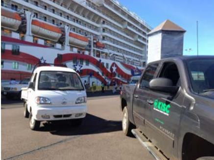
Delivering kiosk to port

Partnerships paid off this quarter in a big way with two of our newest displays. In October, KISC installed the informational kiosk at the