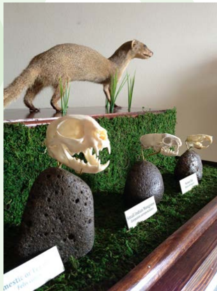
Mongoose display featuring skulls

little fire ants, and some of our top plant pest targets.