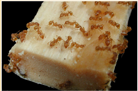
Ellen Van Gelder, USGS

The first infestations of LFA were discovered on Hawai'i island in 1999. LFA have hitchhiked on material from infested areas and are now spreading across the Big Island. Newly introduced and controllable colonies of LFA have been found on Kaua'i and Maui.