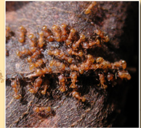
Hawaii Department of Agriculture

Stop the spread of the little fire ant (LFA) in Hawai'i