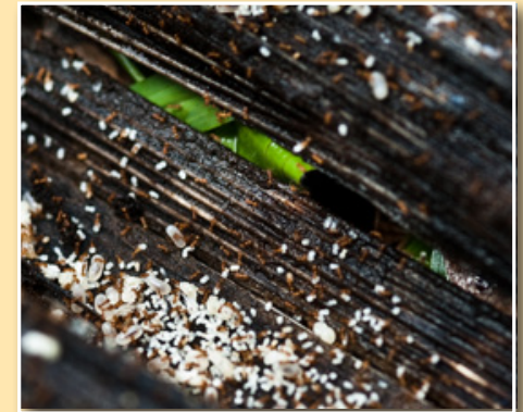
LFA colony in leaf litter

An entire LFA colony can fit inside a macadamia nut shell. The ants can build colonies in any small empty cavity: under or in logs, branches, plant debris, rocks, or even inside furniture.