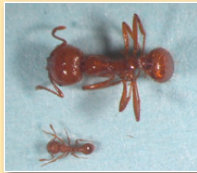
Tropical fire ant (top) compared to LFA (bottom)