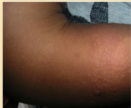
LFA deliver a powerful sting causing large, painful welts

Testing is as easy as a chopstick and peanut butter. Go to www.lfa-hawaii.org to find more information on detecting and testing for new introductions of LFA.