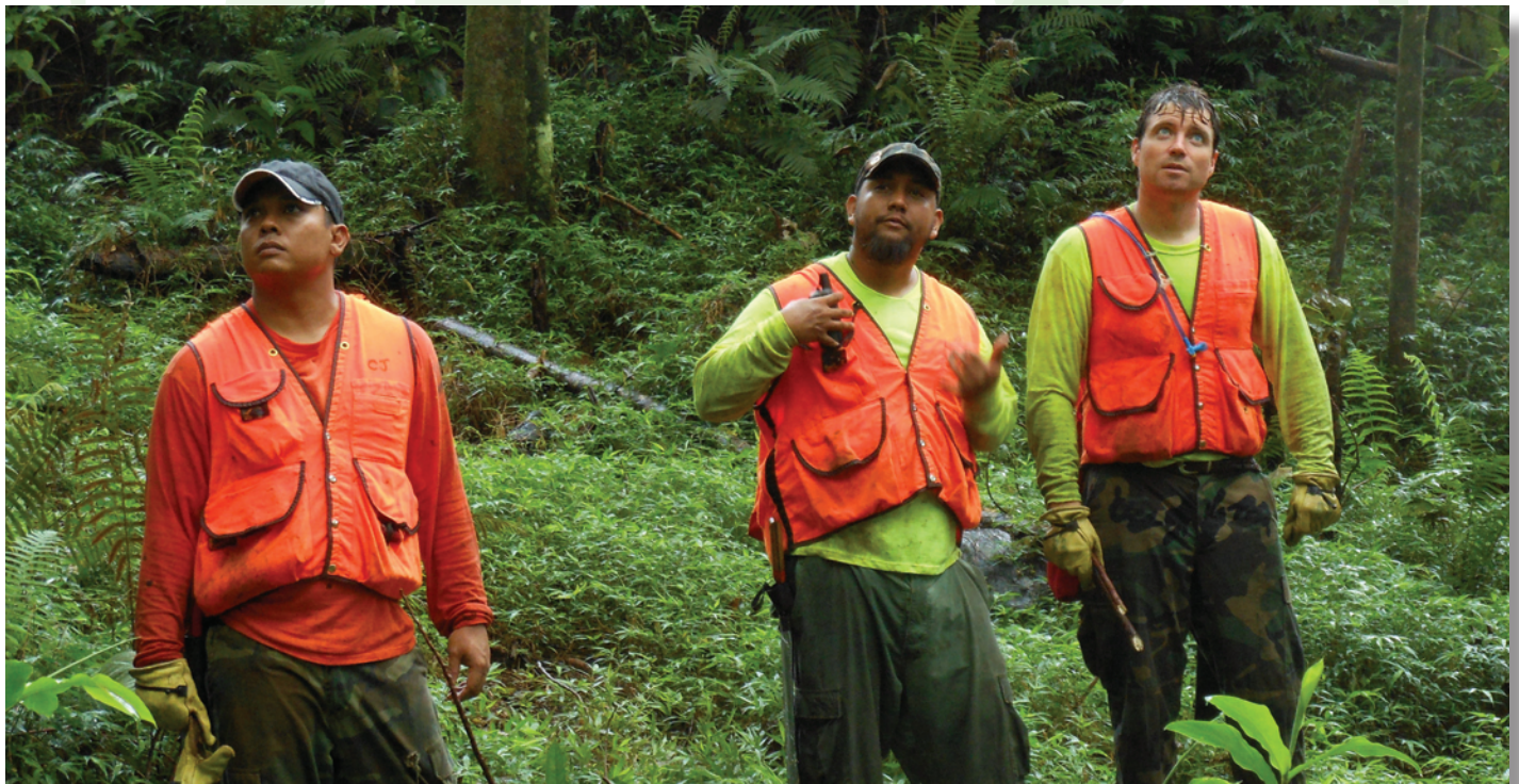
KISC crew deliberating on how to scale a steep area of the Wailua Game Management Area while conducting a miconia survey